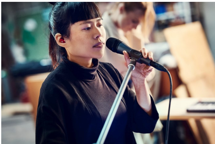
The IE 100 PRO in-ears with their precise, single-driver sound let you monitor with detail and perform with confidence

Whether performing on stage, or recording and mixing in the studio, monitors can be a musician's best friend. Sennheiser's dynamic IE 100 PRO in-ear monitors are a great gift that will let her perform with confidence. They will give her a precise acoustic overview for live performances thanks to their dynamic drivers that deliver a warm sound that's both powerful and rich in detail. Even in extremely loud environments, they sound exceptionally distortion-free and defined. Tough enough for the rigors of live performance yet comfortable enough to wear for hours, these small but mighty in-ears will delight.