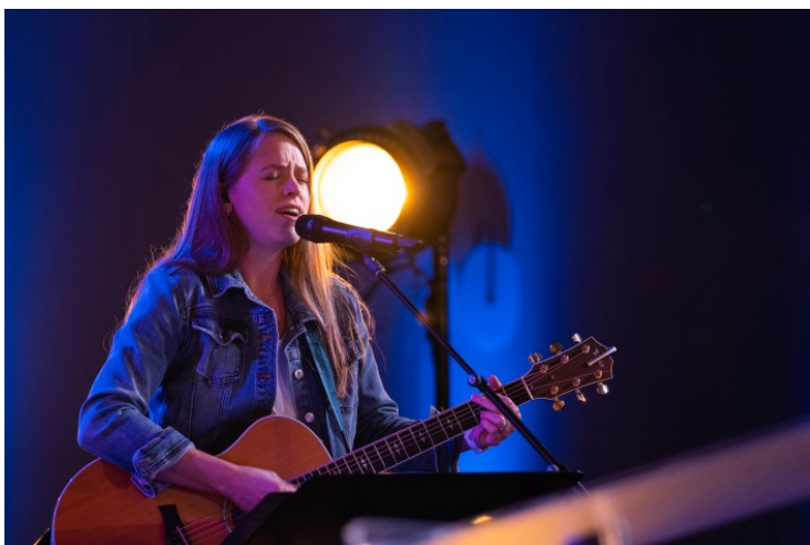
Step forward with wireless – Evolution Wireless Digital has all that is needed

Whatever her musical passion, EW-D has brilliant packages that combine the receiver and the best mic for her performance – including the EW-D 835 Set with the superb e 835 microphone for vocals or the CI1 Instrument Set that can connect to guitars or other instruments via a wireless bodypack.