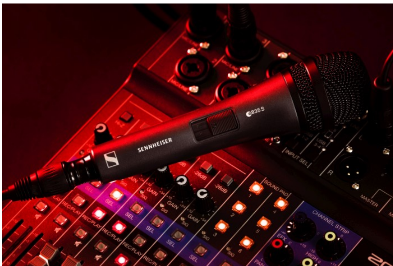
The e 835 is Sennheiser's best-selling vocal microphone – available with or without on/off switch

Sennheiser's best-selling e 835 and e 845 are dynamic cardioid and super-cardioid microphones that are perfectly suited to vocals. They project well and cut through high volumes on stage but are also great for home recording and semi-pro studios. Making vocals come alive, these are popular mics for crystal clear and natural sound without feedback, spill or handling noise. Their extremely durable metal construction means they're able to take on the knocks of a life of performing. Close siblings, these mics share much in common but the super-cardioid pick-up pattern of the e 845 is better at rejecting noise from the side. Considering their amazing quality, these mics are excellent value for money.