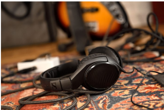
The rugged HD 200 PRO play back powerful studio sound

Sennheiser's closed-back HD 200 PRO headphones are the perfect companion for monitoring – providing powerful studio sound anywhere. They offer detailed sound with significantly reduced ambient noise, making it easier to concentrate on the task at hand. Rugged, durable and exceptionally dynamic, they make every creative task a pleasure and have been designed for comfort over long periods of use.